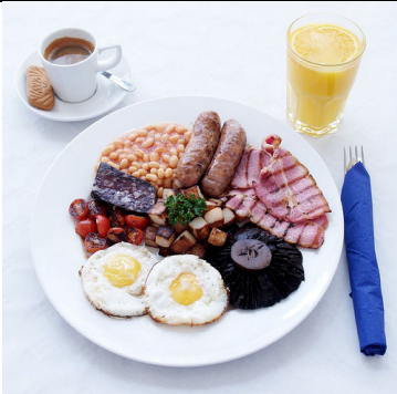
Full English Breakfast